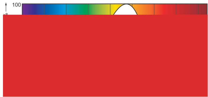
Light Distribution Diagram - 15W Philips LED A21 2700K E26 DIM