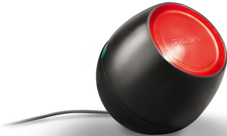
PHILIPS LivingColors Table lamp Micro black LED