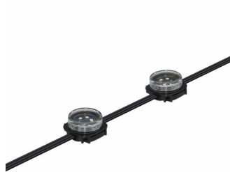
iColor Flex LMX BGC495 LED nodes with clear flat lens