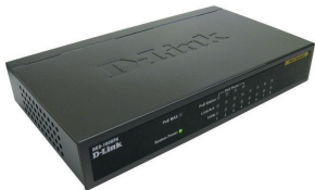
Unmanaged switch 4 POE port, 48 V