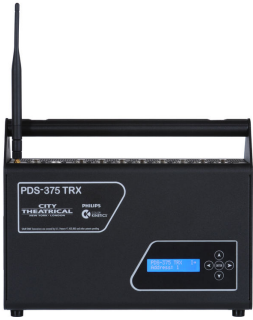
PWRDAT PDS-375 TRX