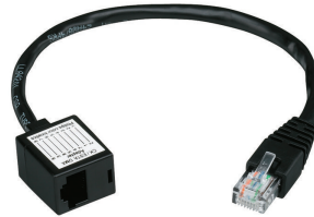
DMX crossover cable, CK to Esta